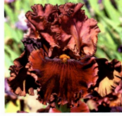
Call To Danger ~ PB