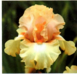
Easy As Pie ~ PB