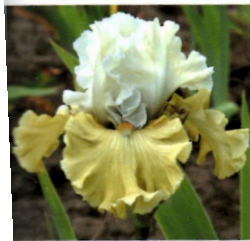
Jungle Mist ~ PB