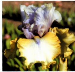
Mayan Sunrise