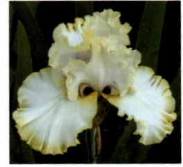
Peaceful Reverie ~ PB