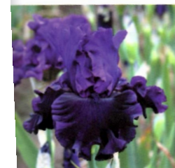
Purple Punch ~ TJ