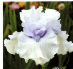
When Angels Sing ~ PB