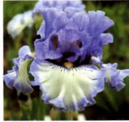
Gentle On My Mind ~ PB