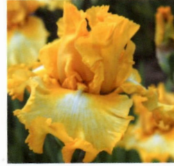
Mac 'N Cheese ~ TJ