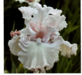
Lasting Moment ~ TJ