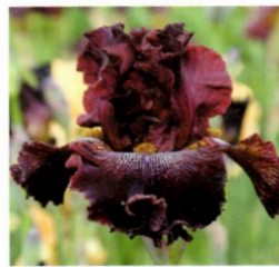
Ruby Tracery ~ PB