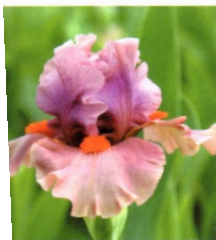
What A Beard! ~ PB