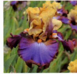
Painted Love ~ TJ