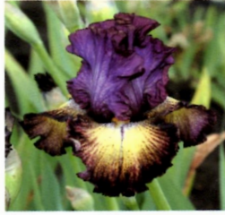
Are You Free ~ PB