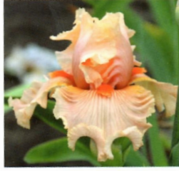
Bedroom Romance ~ PB