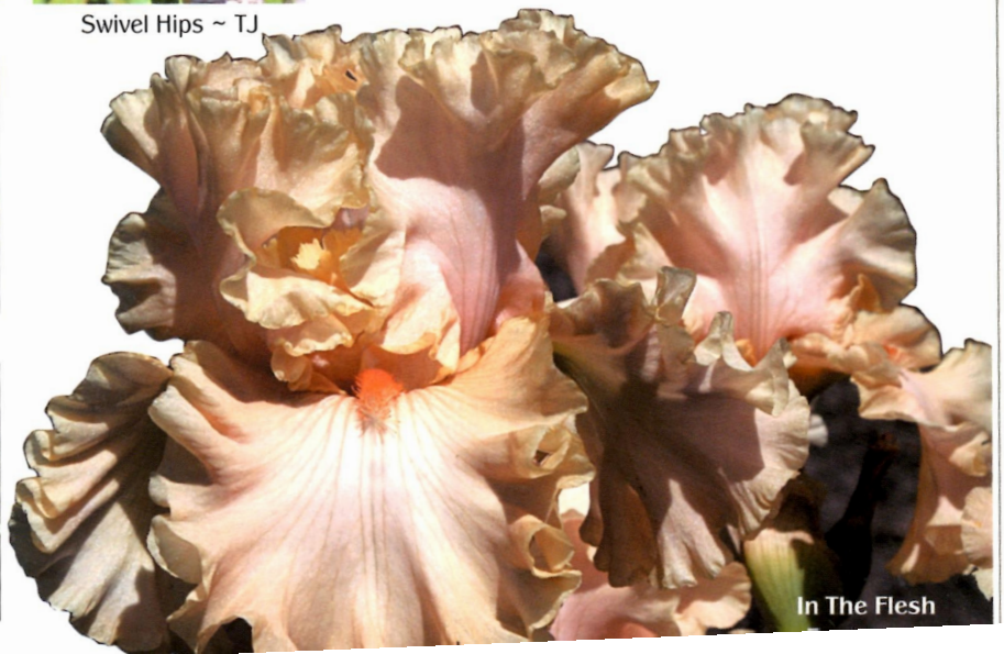
In The Flesh