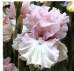
Vanity Girl ~ TJ