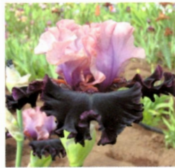
Ninja Warrior ~ LM