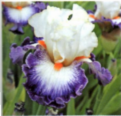
Dancing Delight ~ TJ