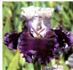
Swivel Hips ~ TJ

These are just a sampling of our new introductions. For more information and to order a catalog go to: www.mid-americagarden.com