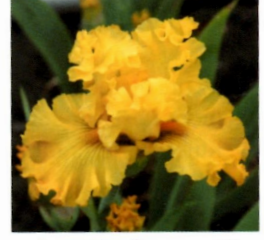
Canadian Brass ~ PB